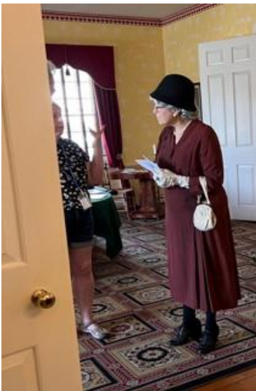
Mary Harlan Lincoln visiting with Reunion attendees in her mother-in-law's (Mary Todd Lincoln) girlhood home.