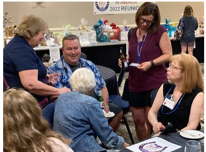
Two generations of family getting reacquainted, gift baskets in the background.