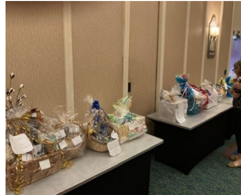
A sampling of gift baskets for the raffle.

Twenty-one beautiful raffle baskets and ten silent auction items were on display in the hospitality room throughout the reunion. The baskets were filled with items from fourteen states and Japan. Attendees enjoyed looking through the impressive selection of gifts and goodies in each, and pondering which basket to try to win by depositing their raffle tickets in the accompanying box.