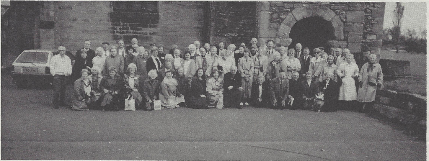
Harlans at St. Peter's, Monkwearmouth, October 23, 1994