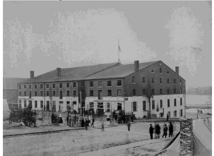
Libby Prison, Richmond, VA