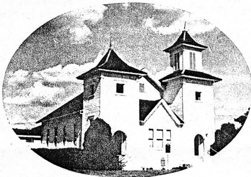
Blue Ridge Baptist Church near Marlin, Texas. Site of annual Harlan reunion.