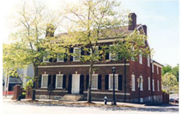
Mary Todd Lincoln House