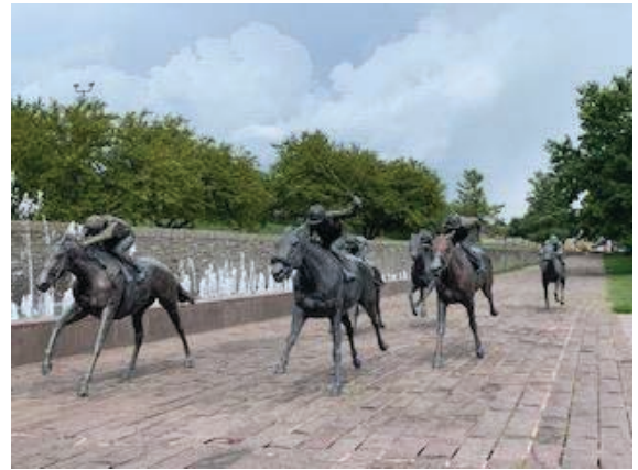
Sculptures at the Thoroughbred Park, Downtown Lexington.

horses and jockeys go through their workouts in the mornings from 6:30 until 10.